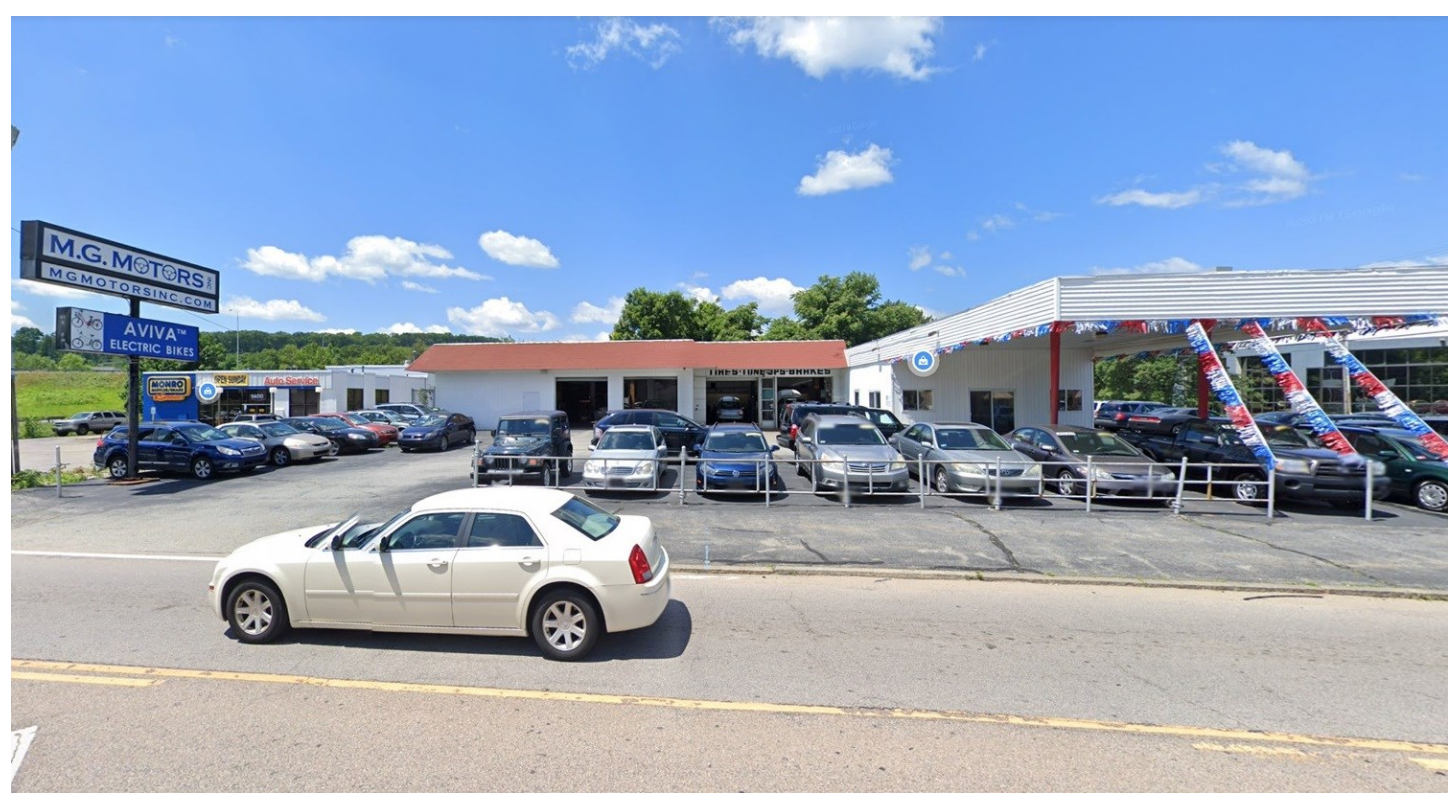
Information presented herein is from sources deemed reliable. However, no warranty can be made as to the accuracy of this information, which is presented subject to prior sale, rental, or withdrawal from the market without notice